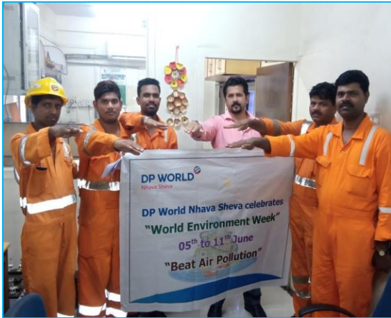
Environment pledge with employees & contracted staff

The awareness sessions with management employees and contracted staff was conducted through Environmental messages, banner display, tool box talks and notice board displays etc.