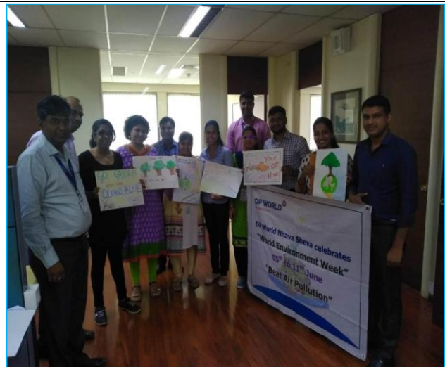
Drawings by the participants