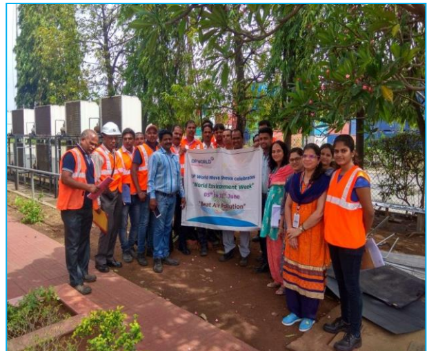
Awareness campaign with contracted supervisor