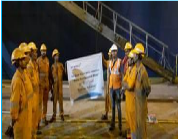
Awareness campaign for lashers / Checkers