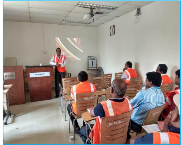
Participants during competition