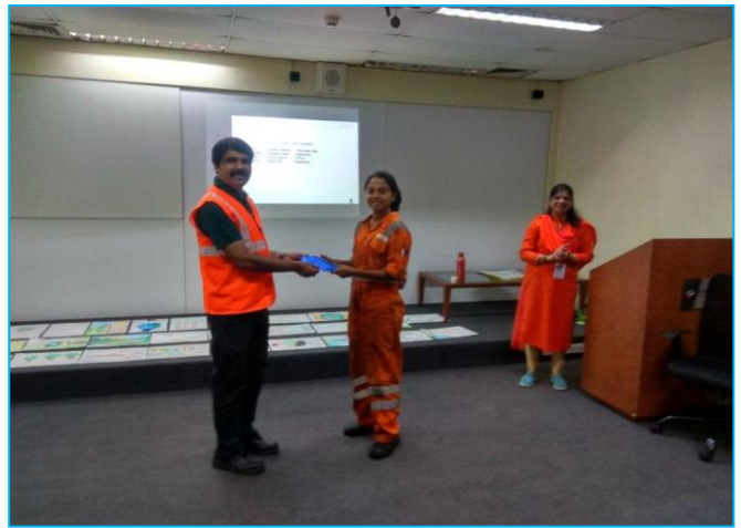
World Environment Week Winners – Poster Competition