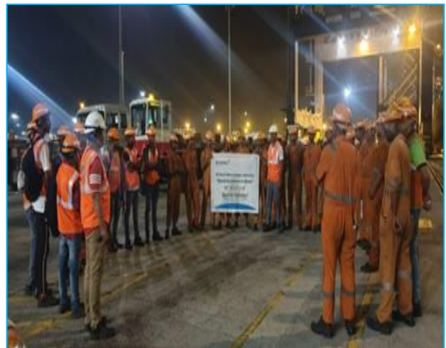
Awareness campaign for employees & contracted staff