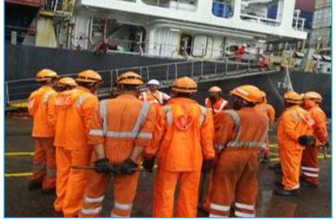
Monsoon Precaution – Awareness with lashers / Checkers