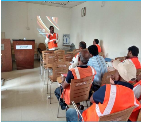
Participants during competition