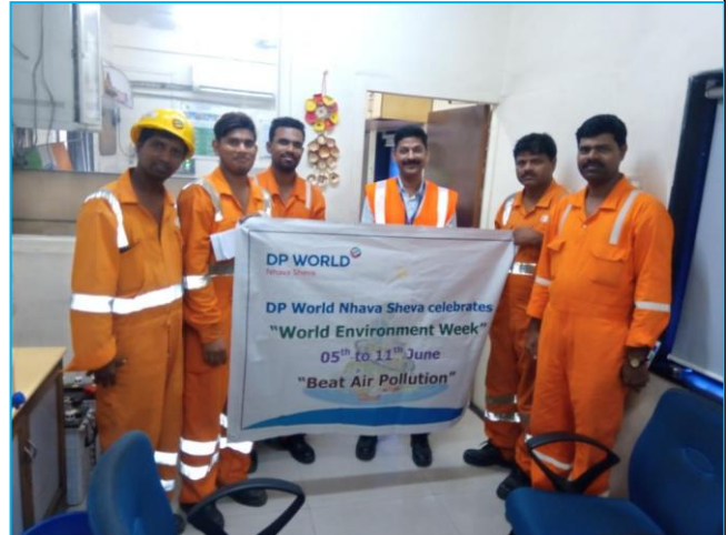
Awareness campaign for employees & contracted staff