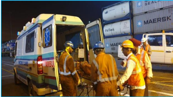
Drill – Rescue of suspended person