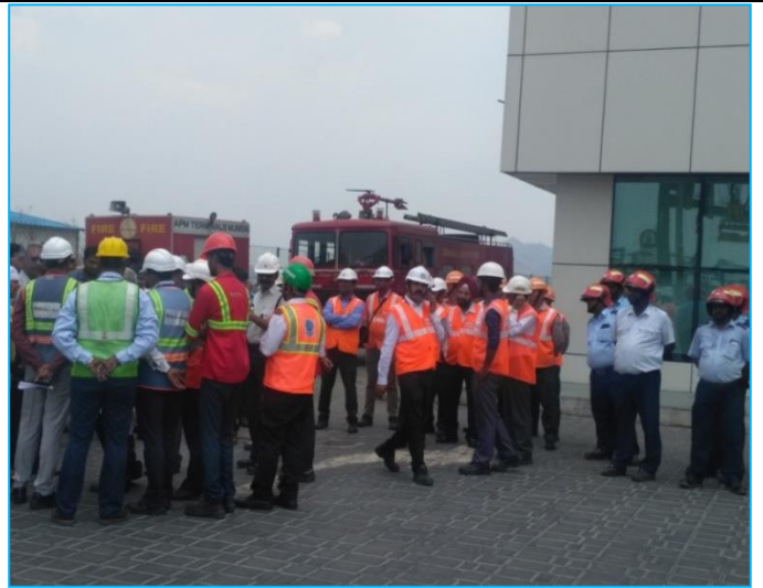
ISPS Drill – Terrorist Attack