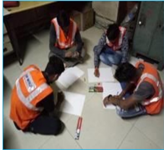
Drawings by the participants