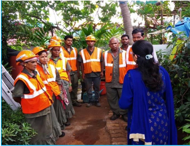
Awareness with Gardening Staff