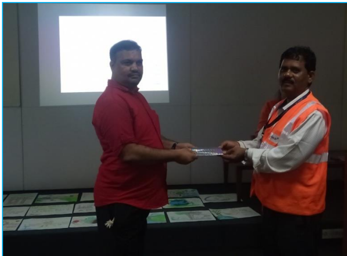
World Environment Week Winners – Slogan Competition