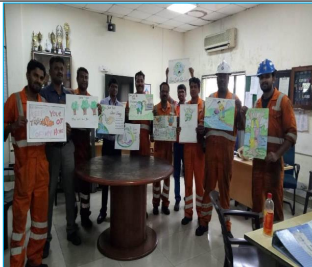
Drawings by the participants