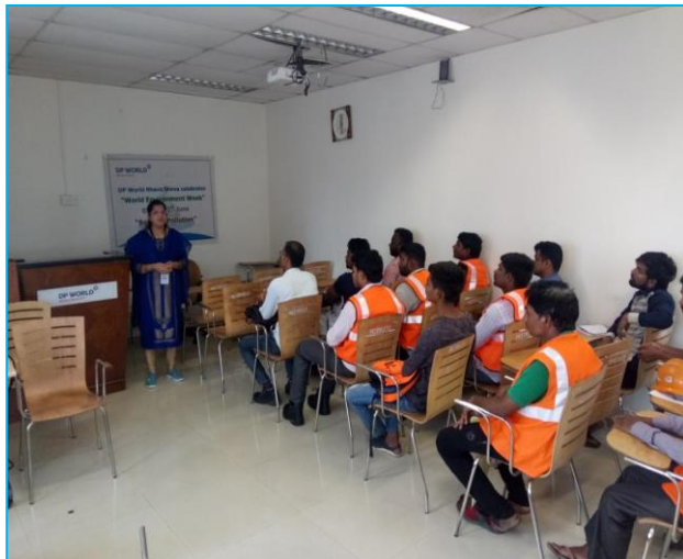
Awareness campaign with contracted staff