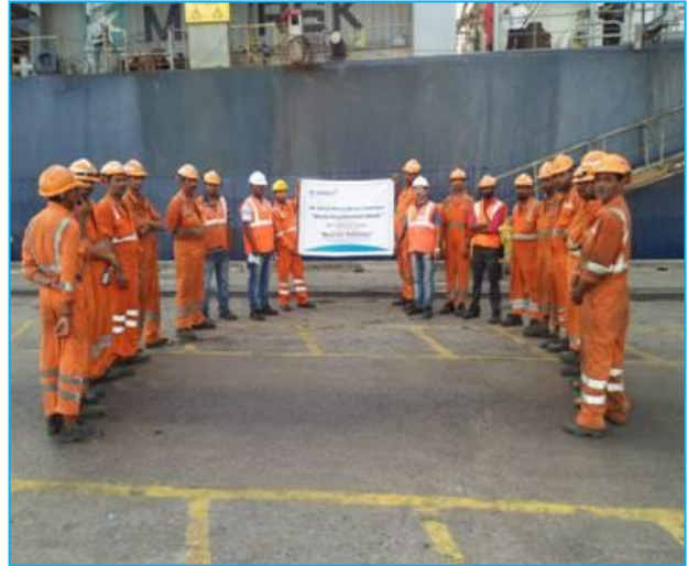
Awareness campaign for employees / contracted staff