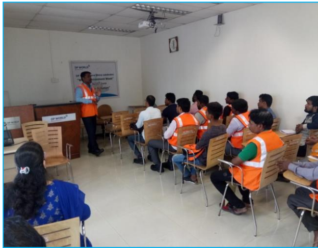
Awareness campaign for contracted staff