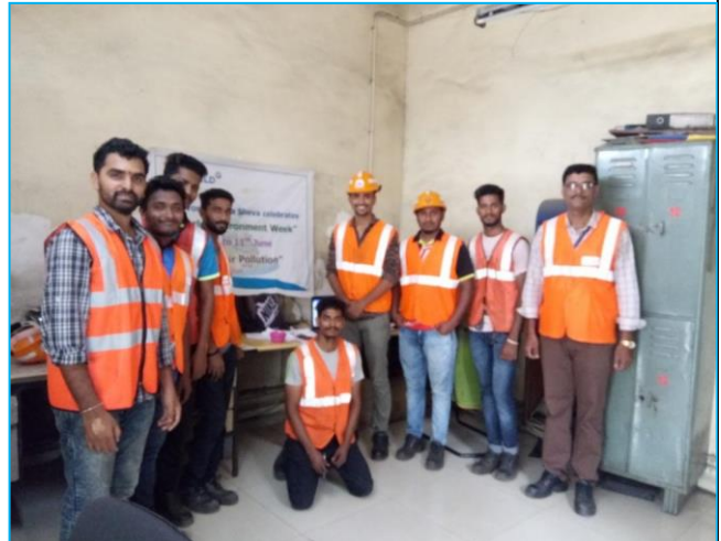
Awareness campaign with reefer staff