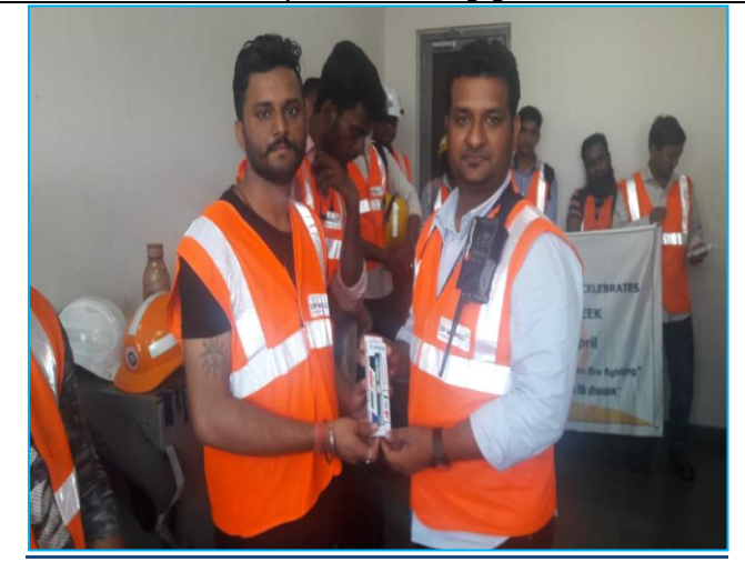
Spot Quiz Competition