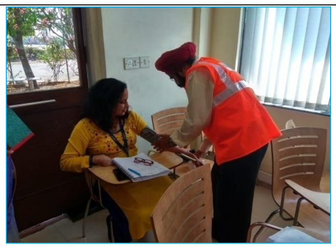
BP Check up for employees