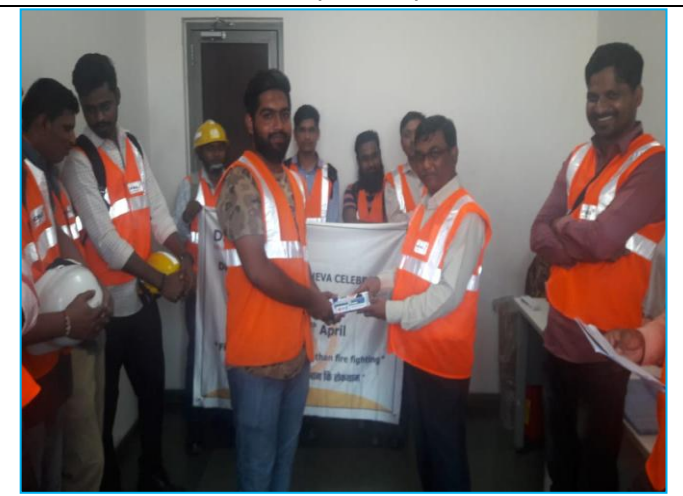
Spot Quiz Competition