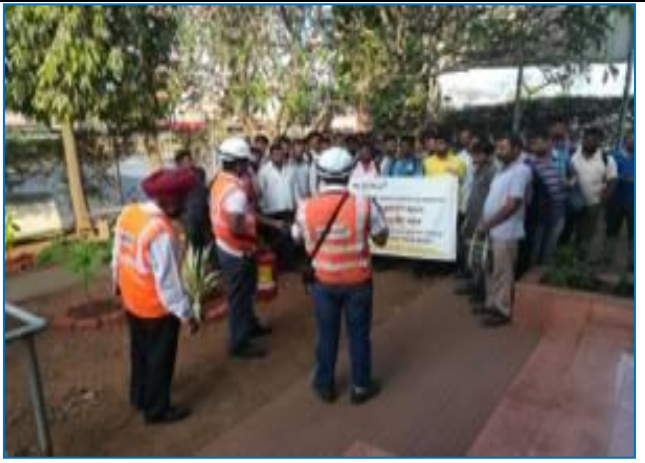
Fire safety awareness with ITV Drivers