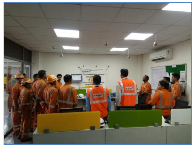
Fire awareness with enginnering team