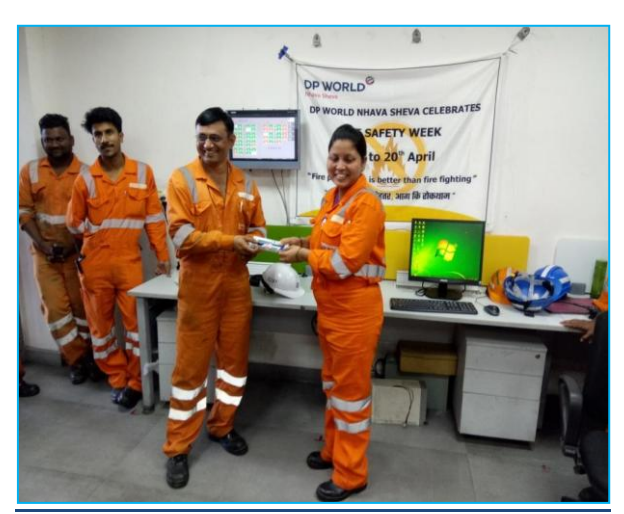
Spot Quiz Competition