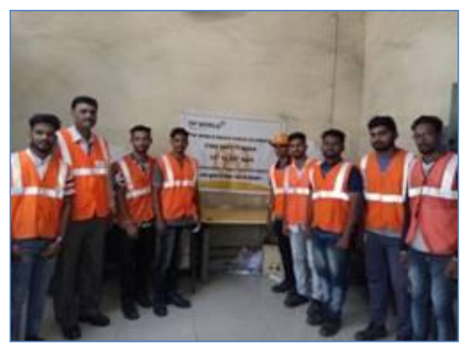
Fire awareness with Checkers / Lashers