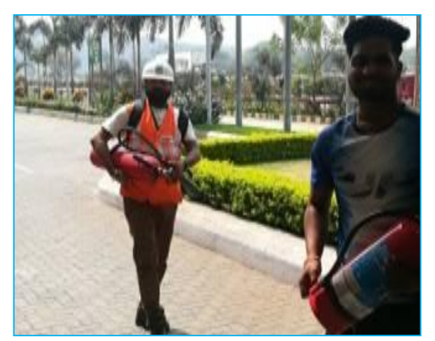
Winners of this competition