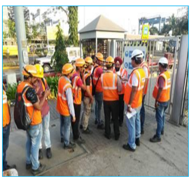
Awareness for contracted staff by paramedic