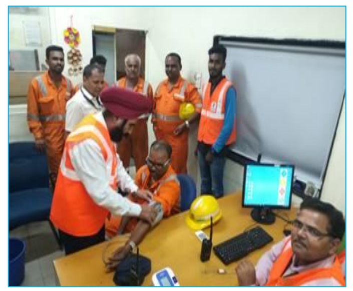
BP Check up for employees