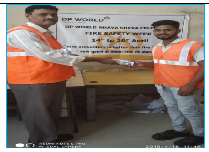
Winner of quiz competition