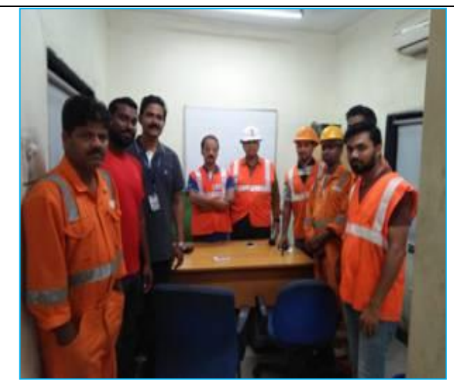
Awareness for contracted staff by paramedic