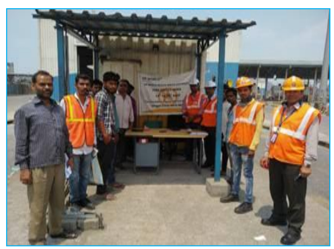
Fire safety Awareness with ITV Drivers