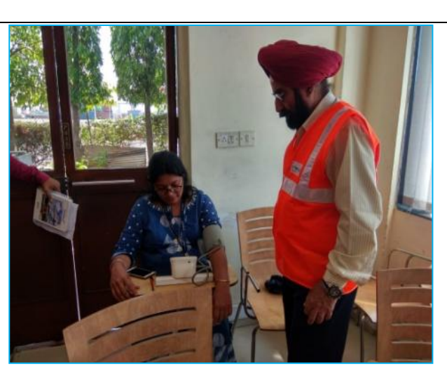
BP Check up for employee