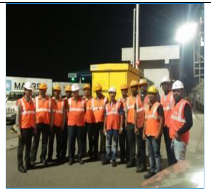
Health Awareness with employees by paramedic