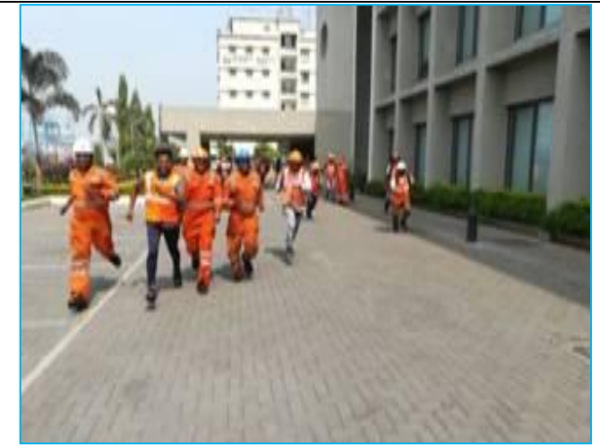
Employees & contractors participating in the competition